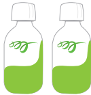
Two bottles of CLENPIQ (5.4 oz each)